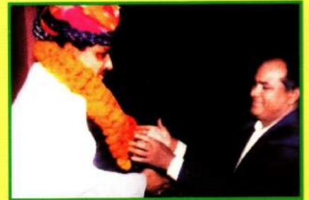
School Director Garlanding Agriculture Minister Mr. Prabhu Lal Saini